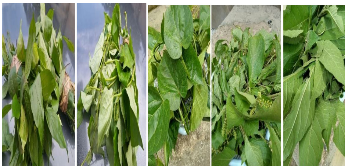
Gnetum africanum/okazi Piper guineense/uziza Gongronema latifolium/utazi Ocimum gratissimum /nchuanwu Vernonia amygdalina/onugbu

Table 1 shows the cooking methods and conditions. Blanched vegetables were done in a stainless steel pot, after which the water was allowed to drain off. King’s brand oil was used for sautéed vegetable samples. The