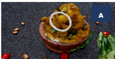
Utazi leaf ( G. latifolium ) Cow leg