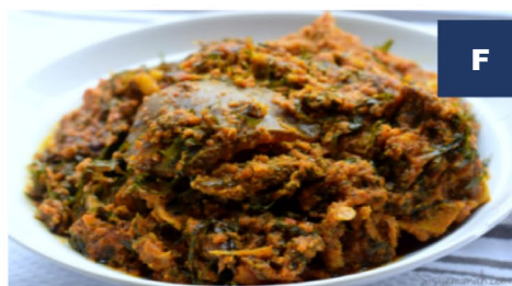
Okasi + Egusi soup