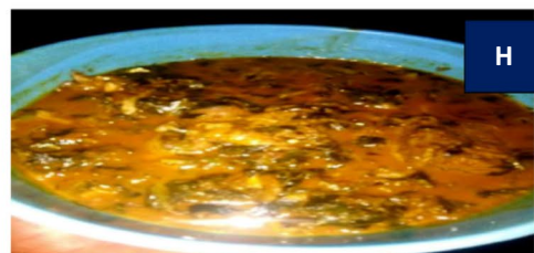
Anara (garden egg) leaf ( S. melogena )