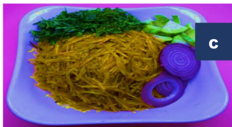
Abacha (African salad), G. latifolium leaf + Solanum melogena fruit