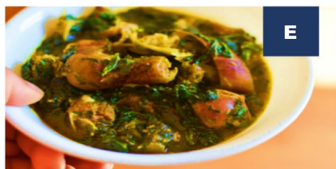
Okasi ( G. africanum ) Soup