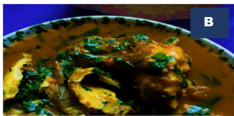
Uziza leaf ( Piper guineense ) soup