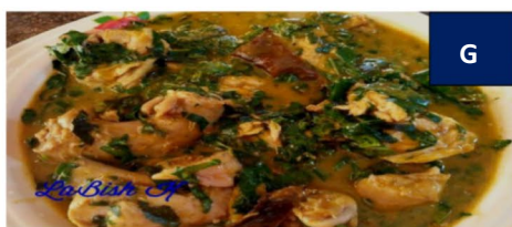
Utazi leaf ( G. latifolium ) chicken pepper