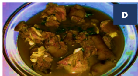
Utazi leaf ( G. latifolium ) goat meat