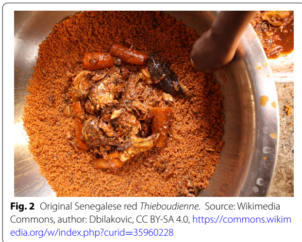
Fig. 2 Original Senegalese red Thieboudienne.

Our research questions revolve around the changes of meaning in the domestication of paprikash and the role of food in the creation of maritime culture and port city narratives. In relation to the research questions and literature review, we propose a hypothesis: Paprikash has detached itself from its ethnic roots and in the process of domestication has become a food representing the maritime character of the city and the heritage of Polish fisheries.