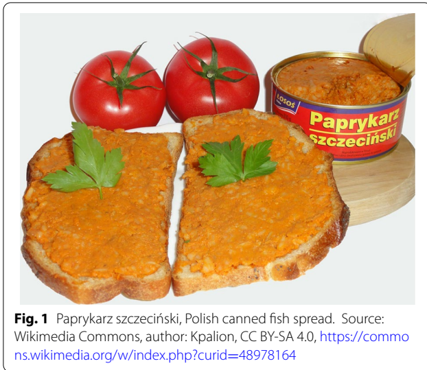
Fig. 1 Paprykarz szczeciński, Polish canned fish spread.