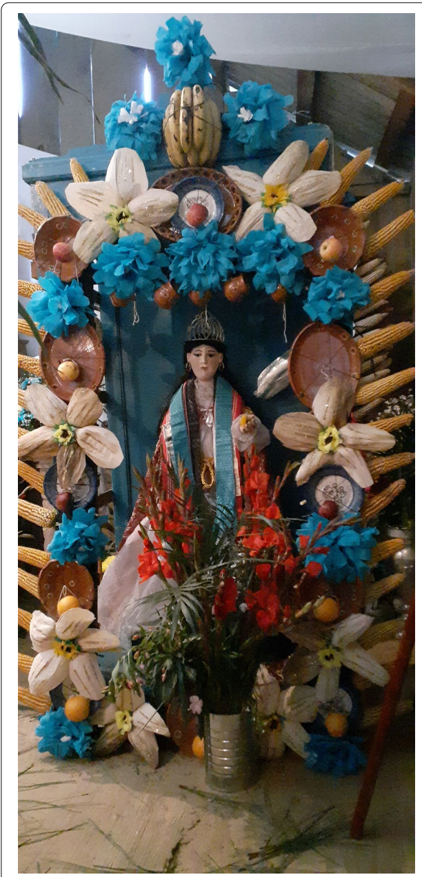
Fig. 2 Santa Inés in the community of Cherán K'eri

decorated with maize and other earth products. Maize was and continues to be the most important crop for the P'urhépecha, from both the nutritional and cultural points of view. People know about the complex forms of denomination and knowledge about it, including the expertise about types and races, their parts, the care of seeds, and life cycles, as well as the environmental and cultural requirements for its development and consumption of the species [64, 65].