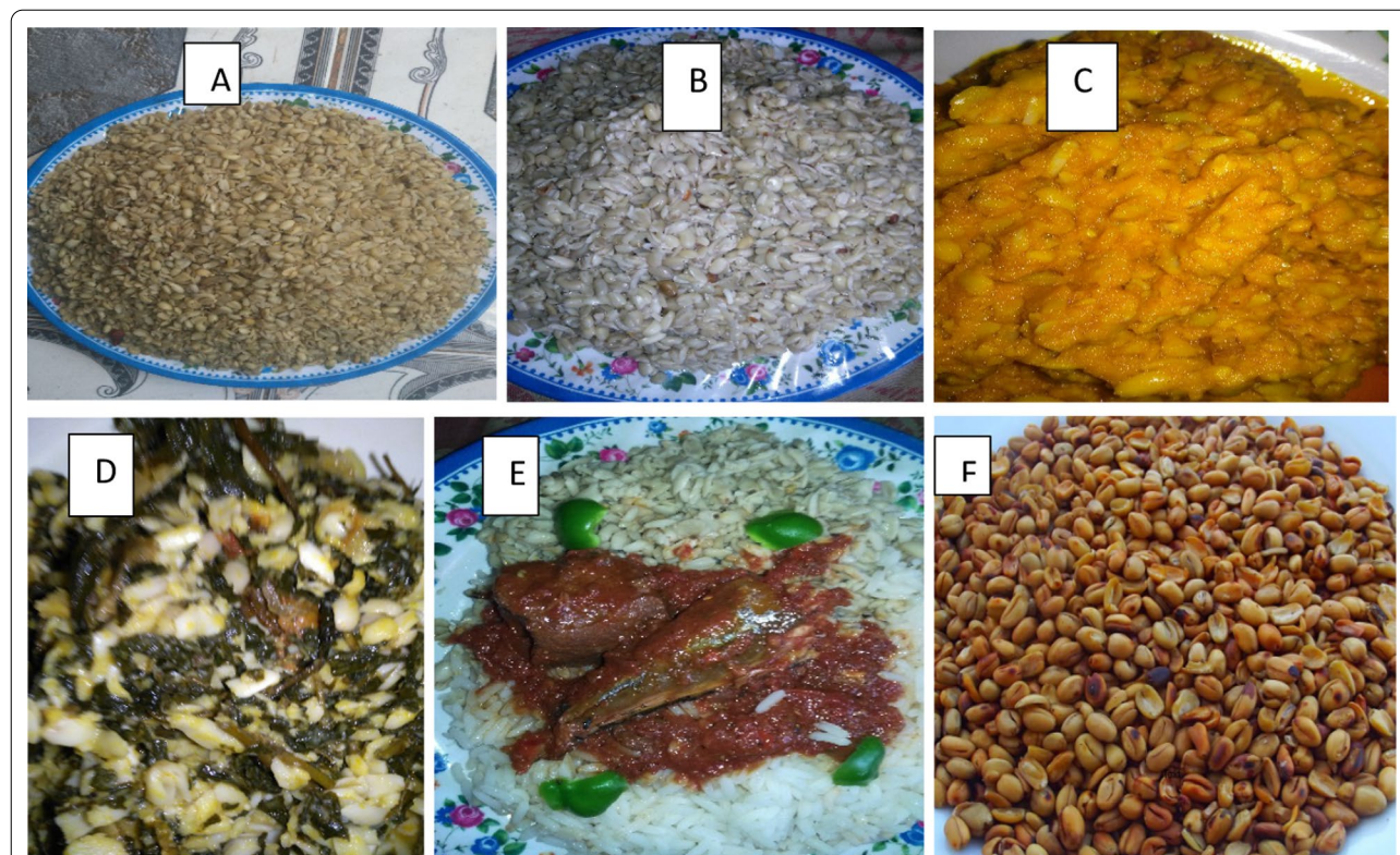
Fig. 5 a–f Dehulled African breadfruit; Boiled African breadfruit porridge; Roasted African breadfruit.

roasted and eaten as snacks (Fig. 5f). Whichever method of preparation, ukwa usually comes out delicious and appetizing. Freshly processed (washed) African breadfruit (ukwa) or dried ones can be used for preparing this dish. If it is dried, it should be soaked overnight in cold water to reduce the cooking time. Some people also add potash to shorten the softening time during cooking. In some parts of South East Nigeria (Anambra), fermented legume condiment (Ogiri) is added to give some aroma and flavour. It may be fried with or without the bran.