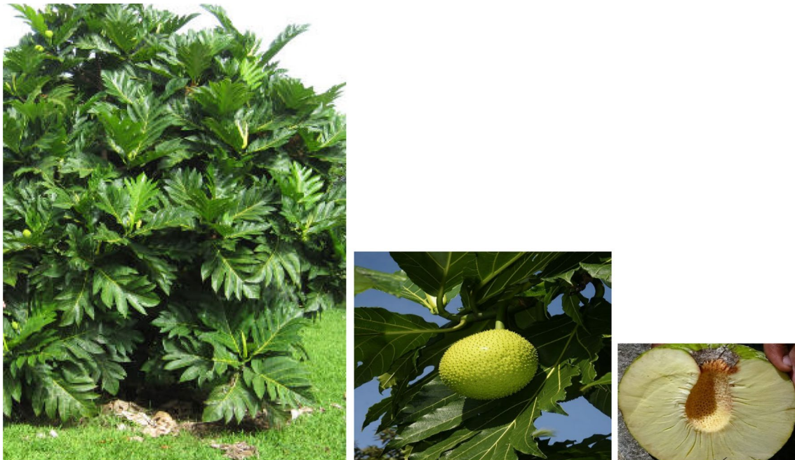
Fig. 2 ( Artocarpus altilis ) Parkinson (Breadfruit).