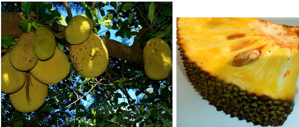
Fig. 3 Artocarpus heterophyllus Lam (Jackfruit).

( Artocarpus heterophyllus ) are without lobes and are smaller than breadfruit leaves. Jackfruit male flowers and the fruits are borne on stems on the tree trunk or branches. Breadfruit leaves are large with indents and is believed to have originated in New Guinea and the Indo-Malaysia [11, 16]. Breadfruit is closely related to the jackfruit ( Artocarpus heterophyllus ), from which it might have been naturally selected. It is similar in outward appearance and they belong to the same genus [19].