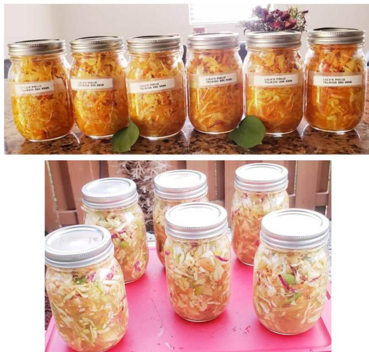
Fig. 4 Photographs of homemade pikliz as prepared using traditional family recipe and stored in sealed containers for fermentation. This process enhances the flavor of the pikliz , preserves its contents, and increases the lifespan of the pikliz

Carrot is a root vegetable belonging to the Apiaceae family which consists of mostly aromatic flowering