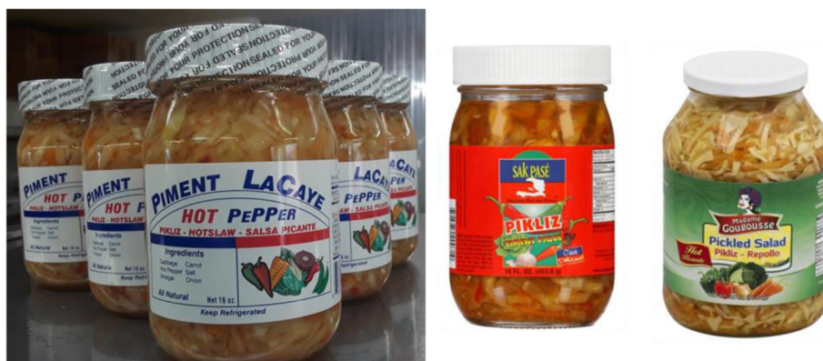
Fig. 2 Selected photographs of various pikliz brands available at designated grocery stores and online markets [13–15] throughout the USA as commercialization of pikliz continues to increase among Haitians living at home and abroad

This spicy fermented meal garnishment, pikliz , has long been prepared at the household level in Haiti; however, as the number of Haitians living abroad continues to increase, commercialization of pikliz on an industrial level has systematically increased (Fig. 2). Nowadays, pikliz can be purchased at major supermarkets in the USA, such as Walmart®, Publix Market®, and other regional supermarkets (Fig. 2). Altogether, pikliz remains the symbol of Haitian culture (Figs. 3 and 4).