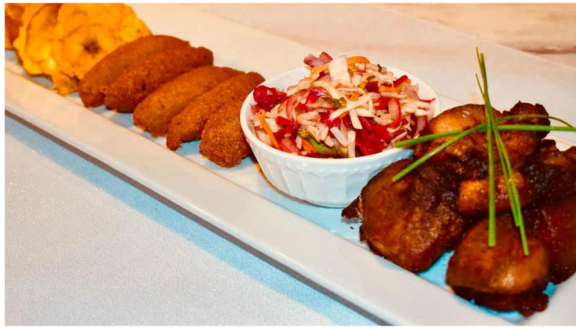
Fig. 3 A typical Haitian meal ( fritay ) served with pikliz . Left to right: fried plantain ( bannann peze ), malanga fritters ( akra ), pikliz , and fried pork ( griyo ) as prepared by Manje , a Caribbean fusion catering service in Fargo, North Dakota [16]