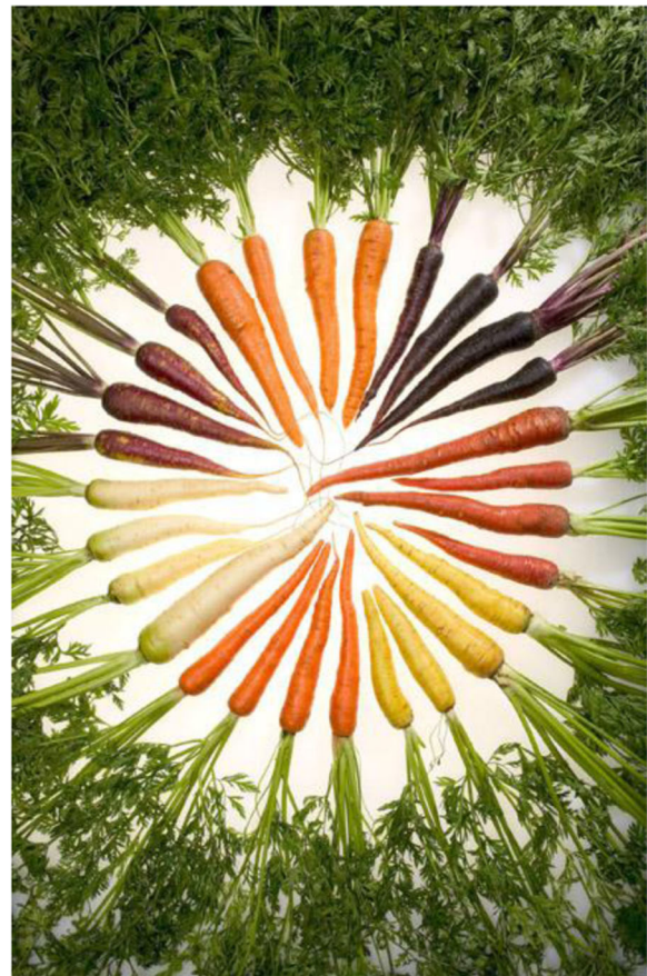
Fig. 5 Various colors of carrots selectively bred with pigments reflecting most of the colors of the rainbow by the Agricultural Research Service (ARS) under the USDA. See the link in ref. [30] for additional details