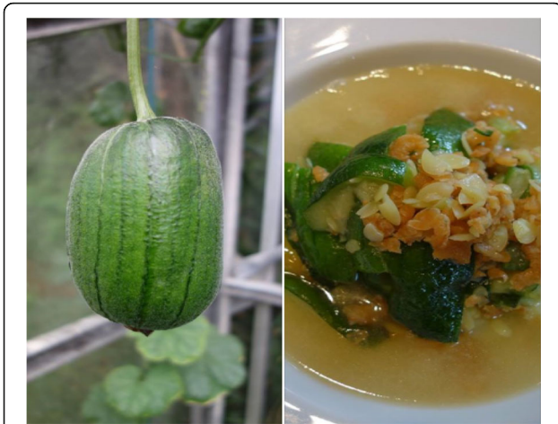
Fig. 2 The luffa growing and the luffa dish made by research participant P14.

children and husband is quite meaningful for me, which further makes me obtain the “home feelings”.