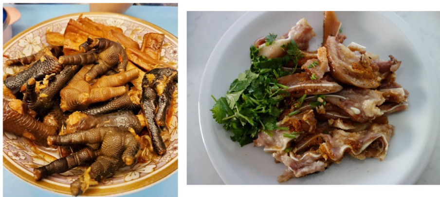
Fig. 7 The "chicken legs and pig ears" dish made by P5.

Accordingly, it is interesting to point out that Taiwanese immigrant women apply various of different aspects