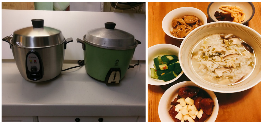
Fig. 6 P17’s Ta Tung steam cookers and the foods she made using the cooker.