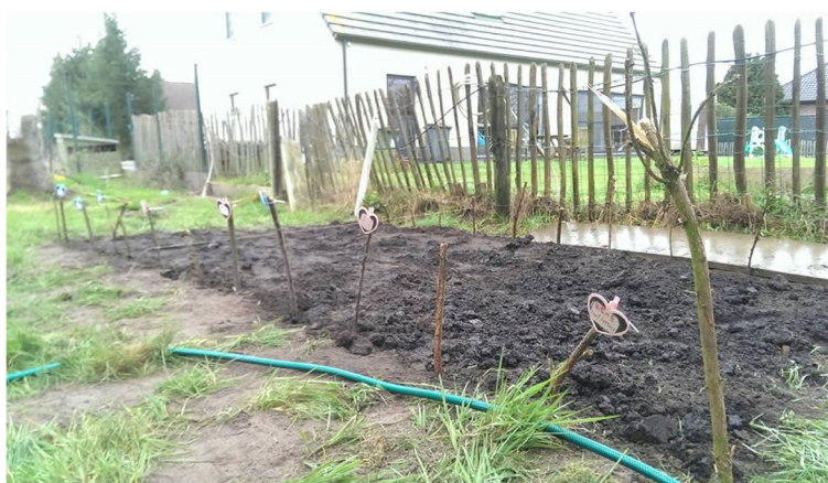
Fig. 1 The “Taiwan corner” in P1’s home garden.

I usually go to buy the food ingredients from the supermarkets with my children after school. I think my children already have Belgian cuisine for breakfast and lunch, and they have a lot of salad, bread, sandwiches... and for me, I think the traditional Belgian foods are tasteless and unhealthy..., so, I insist on cooking Taiwanese or Chinese styles of foods and dishes for my children for dinner, since I believe that our ‘Taiwanese’ or ‘Chinese’ foods taste better and are healthier than the Belgian ones..., moreover, in the food preparing and making procedures, I also like to invite my children to do it with me, and during the process, I will share stories about these Taiwanese or Chinese foods and cuisine cultures with them..., and you know, making these foods with my