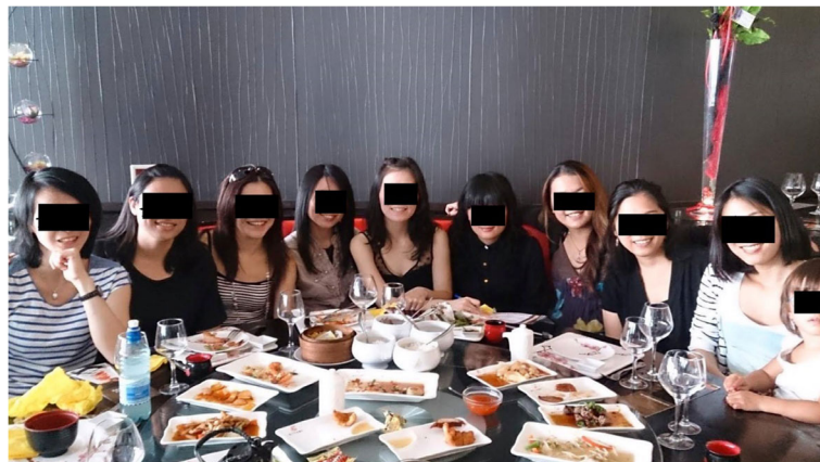
Fig. 4 The food sharing and social gathering activity held by the virtual community “Belgian Taiwanese Immigrant Wives Chat forum.”

... I still remember that, when I decided to emigrate to Belgium many years ago, my Taiwanese mom reminded me to take a Ta Tung steam cooker with me. She said, “A Ta Tung steam cooker can make your foods very easy...”, you know, the Ta Tung