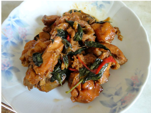
Fig. 5 The “three cup chicken” (三杯雞) cooked by P12.

steam cooker seems like Taiwan’s national product. In Taiwan, I can say that more than 90% of Taiwanese homes do have of this brand of steam cooker..., and you know, it is quite strange that if I use another brand of steam cooker to cook rice or make foods, you know, it tastes less tasty, I don’t know why..., but if I use the Ta Tung steam cooker to cook rice or make dishes, the flavors will be good..., I guess maybe it is because we [i.e. Taiwanese people] are used to utilizing this brand of steam cooker to cook rice and make foods.