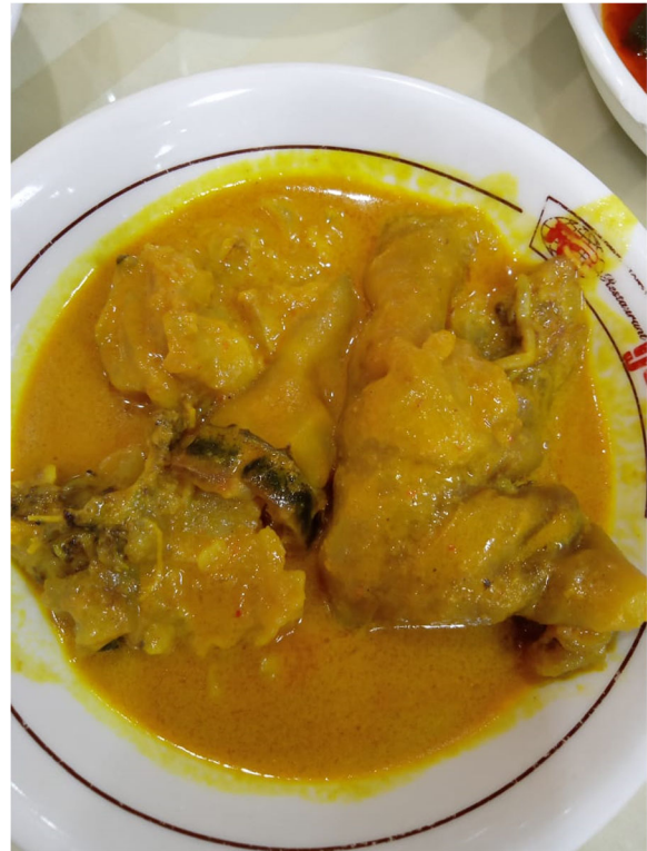
Fig. 5 Kikil Curry Spicy (Gulai Kikil). Kikil curry usually uses soft veal skin. The mixture of spices, chilies, turmeric leaves, orange leaves, and coconut milk combined with Kikil broth makes this cuisine deliciously extraordinary