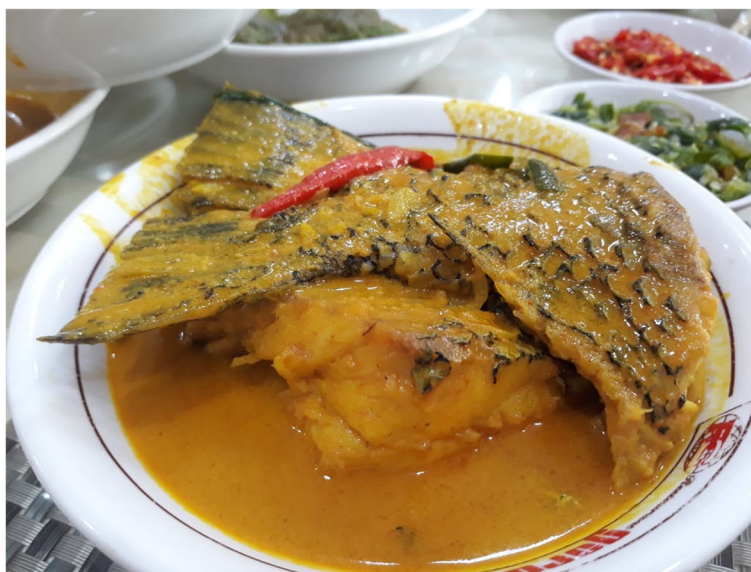
Fig. 4 Fish Curry Spicy (Gulai Ikan). Fish curry usually uses fresh snapper or other sea fish. A mixture of spices, turmeric leaves, orange leaves, kandis acid, and coconut milk makes this dish savory