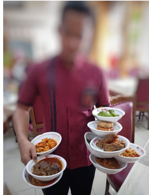
Fig. 7 Manatiang Piring. Manatiang Piring is a way a waiter brings food to be served on the table by carrying many dishes containing food at once.

Traditional food is said to be the regional cultural identity because each traditional food has distinct characteristics that differ from one region to another [3].