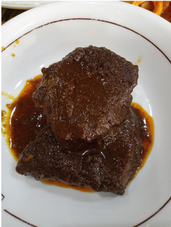
Fig. 3 Rendang. Rendang is made from a mixture of spices and coconut milk. Usually use onions, garlic, turmeric, ginger, galangal, cardamom, cinnamon, cumin, chili, and thick coconut milk. The protein used is beef, buffalo meat, chicken, and eel. Cook over the furnace for 5 to 6 h