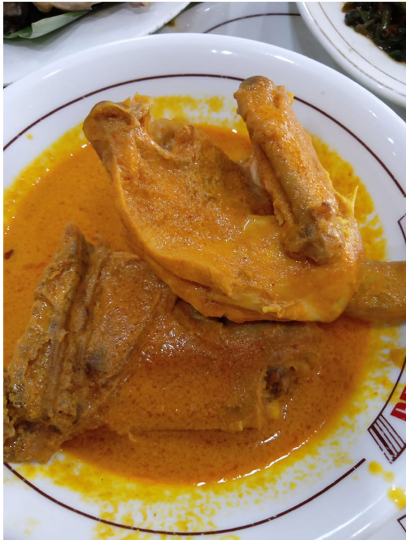
Fig. 6 Chicken Curry Spicy (Gulai Ayam), chicken curry. Chicken used is organic because it is considered healthier. The mixture of spices, chilies, turmeric leaves, orange leaves, and coconut milk are the main ingredients. Chicken broth blends with the spice mixture makes this dish savory and delicious. Source: Author Documentation, 2020. Figs. 3, 4, 5, and 6 were taken on March 5, 2020

and asam padeh meat; and savory dishes from coconut milk such as fish curry/seafood/jackfruit/long beans/ducks, kalio meat/chicken/egg, and beef rendang/egg/chicken. Some Minangkabau dishes are also derived from cultural acculturation as a result of cultural contact that has stopped in Minangkabau such as Arabic, Persian, Indian, Dutch, and Chinese. The culinary acculturation is a case of Minangkabau lettuce which is similar to Dutch food but has a minimal taste.