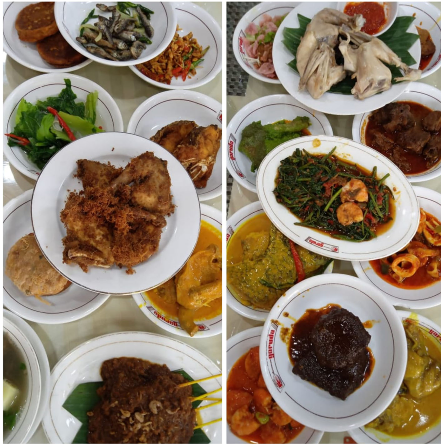
Fig. 2 Various types of Minangkabau cuisine. Minangkabau cuisine is usually served for daily cuisine and religious and customary holidays. This dish is served by serving at Padang restaurant, and customers can choose the type of cuisine they want to eat. It was taken on March 5, 2020

The authenticity of Minangkabau cuisine as a cultural heritage of food is ethnic food that has characteristics compared to other regions. This is in line with [18] that ethnic food that is processed from local resources available in a particular local area with the ability of local knowledge in its processing. As it is in the context of the authenticity of Minangkabau cuisine, it is known for its savory and spicy taste. This savory and spicy taste is obtained from coconut milk and red chili which dominate Minangkabau's spices and mixed with various kinds of spices. Raw materials in Minangkabau cuisine consist of animal, fish, and plant products such as beef, duck, chicken, sea fish, and vegetables which use cassava leaves, jackfruit, long beans, and beans. The hallmark of Minang people in processing Minangkabau cuisine is to prioritize the composition of seasoning which is blended with ingredients and condiments that are thick and thick. The spices used come from Indonesian soil so that the resulting flavor becomes more familiar to the tongue of the general public.