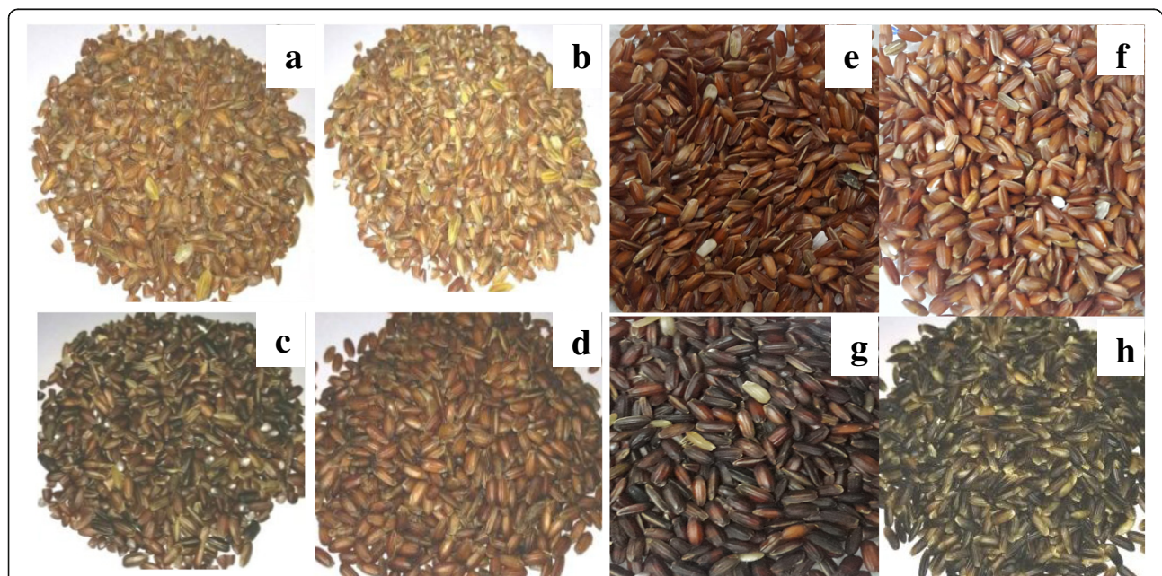
Fig. 2 Some traditional South Indian rice varieties. a Red Kavuni. b Kaivara Samba. c Kuruvi Kar. d Poongar. e Kattu Yanam. f Koliyal. g Maapillai Samba. h Black Kavuni. Kavuni possesses anti-microbial activity. Kaivara Samba lowers blood sugar levels. Kuruvi Kar is resistant to drought and consumed by the locals for its health benefits. Poongar is consumed by women after puberty and is believed to avert ailments associated with the reproductive system. Kattu Yanam lowers glucose level in blood and also imparts strength. Koliyal is widely consumed as puttu , a specialty dish. Maapillai Samba has a hypocholesterolemic effect and anti-cancer activity and also improves fertility in men. Black Kavuni is resistant to drought and is popular among locals for its health benefits

Protein is the second major component next to starch; it influences the eating quality and the nutritional quality of rice. In India, the dietary supply of rice per person per day is 207.9 g, this provides about 24.1% of the required dietary protein [2]. Rice has a well-balanced amino acid profile due to the presence of lysine, in superior content to wheat, corn, millet and sorghum and thus makes the rice protein superior to other cereal grains [36]. The lysine content of rice protein is between 3.5 and 4.0%, making it the highest among cereal proteins. The endosperm protein comprises of 15% albumin (water soluble), globulin (salt soluble), 5–8% prolamin (alcohol soluble), and the rest glutelin (alkali soluble) [27].