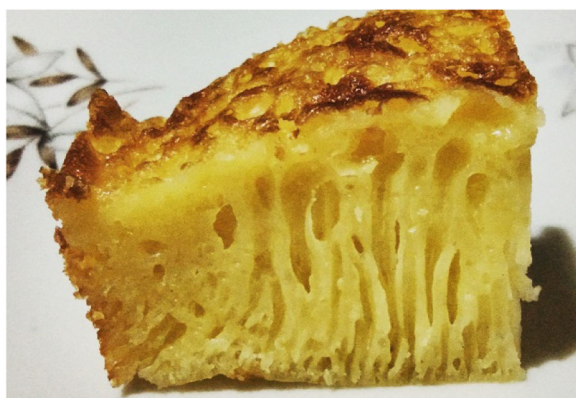
Fig. 2 A wasp’s nest pattern on Bika Ambon ’s inner texture. Its inner texture is usually yellowish; meanwhile, the surface of Bika Ambon can be a bit brownish and crispy. When eaten, it feels chewy, soft, and sweet. However, when overbaked, it may taste bitter. Bika Ambon can come with various flavors (e.g., chocolate, vanilla, and honey), but the one in the picture had an original taste

Perhaps another compelling speculation about the origin of Bika Ambon was offered by Christopher Tan who suggested that the word “ Bika ” was a Dutch-loanword [7]. Bika Ambon ’s internal texture resembles that of a honeycomb and a honeycomb is found in a beehive. The