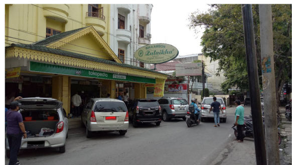
Fig. 3 Mojopahit Street of Medan, North Sumatra, where tourists usually buy Bika Ambon . The street was named after a famous ancient empire “ Majapahit ” based in Java (1293–1500). Cars usually park on the left and right sides of the street; hence, traffic congestion is to be expected in this area. There are many Bika Ambon sellers in Mojopahit Street but the famous one is Zulaikha’s Bika Ambon shop. Visiting Mojopahit Street for local souvenirs is usually included in the local tourist itinerary

Although nowadays Bika Ambon is available in many big cities in Indonesia, local tourists will not miss the opportunity to buy Bika Ambon as a souvenir when they visit Medan, perhaps due to its authentic feel when they buy the cake from the city it originated from. The authentic Bika Ambon is available along Mojopahit Street (Fig. 3). There are dozens of Bika Ambon producers along this street. They will all claim that they are original or authentic Bika Ambon producers. Considering that about 87% of Indonesians are Moslems, most Bika Ambon producers in the city attempt to offer Bika Ambon as a Halal cake. Today, Bika Ambon producers on Mojopahit Street no longer use tuak (e.g., wine) so that they can target the Muslim market.