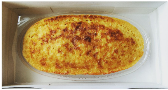
Fig. 1 Bika Ambon has a yellowish color and many pores on its surface. The origin of Bika Ambon is fuzzy, but it is taken as an ethnic food from Medan, North Sumatra. The premium Bika Ambon in the picture is sold in a nice carton box and a disposable plastic box as another layer of protection. If it is kept in a refrigerator, it stays good for 3 days. Bika Ambon also comes in several shapes (e.g., square, oval, and round) and flavors